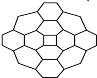
Fig. 2. 2-D graph of carbon nanocones C_4[2] with n=4, k=2 .

The main result of this paper is as follows: